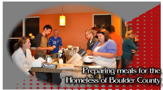
Preparing meals for the Homeless of Boulder County